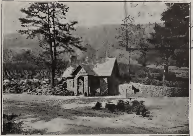
Boxwood Gardens, Our New Branch Nursery and Display Grounds recently opened on the Jefferson Highway near Afton, Va.

NOTICE OF WARRANTY. While we are very careful to keep our varieties true to name, in the event they should prove otherwise, we cannot be responsible for more than the amount we receive for the stock.